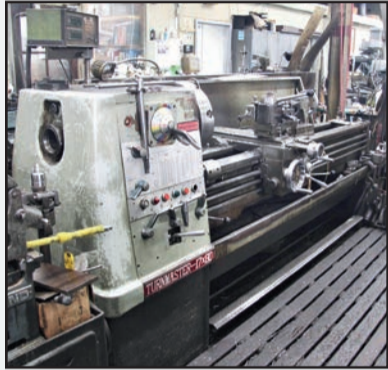
17" x 80" Turnmaster Gap Bed Lathe