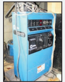
Miller "Syncrowave 351" AC/DC Welder