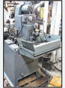
Sunnen MBB-1600 Hone