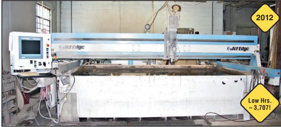
8' x 13' Jet Edge with IP-6050 Intensifier

FEATURING: 2012 8' x 13' Jet Edge Water Jet System • Lathes – Up to 24" Swing • Bridgeport Mills & CNC Profiler • Grinding • Hone • Saws • Large Quantity of Shop Support & Tool Crib • Inspection/Quality Control • Raw Material • Plus Much More!