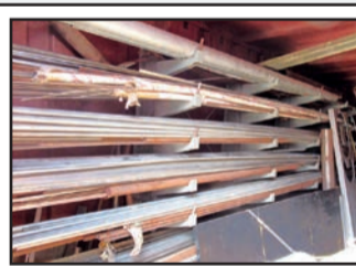
Partial View of Material