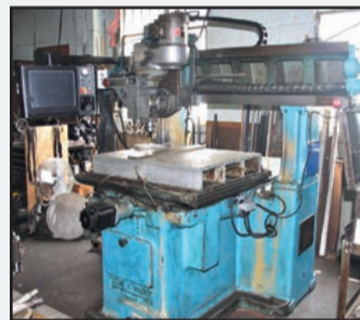
P&W CNC Profiler with Bridgeport Vari-Speed Head and Mach III CNC Control