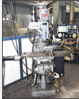
Bridgeport "Series I" CNC Knee-Type Mill with Bandit III Controls