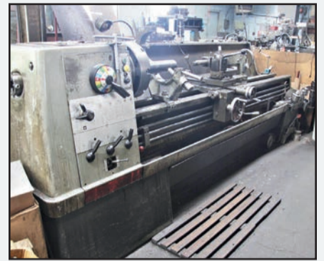
21" x 100" Clausing Colchester Lathe