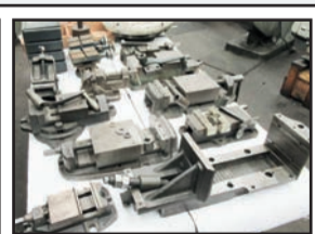
Partial View of Tooling and Accessories