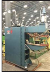
H&H 200-KVA Press Type Spot Welder