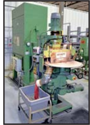
Bennett Type CG14 Rotary Grinder