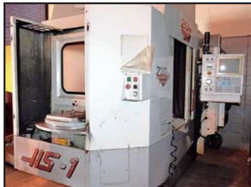
Haas Mdl. HS-1 CNC Horizontal Machining Center