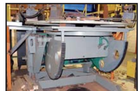
Ransome Mdl. 250P-A Welding Positioner