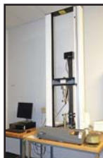
Instron Mdl. 3367 Tensile Tester