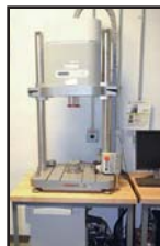
Instron Mdl. E3000 Electro-Plus Fatigue Tester