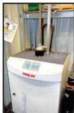
Parlec Type IS6 3200-WK Thermogrip Tool Setter