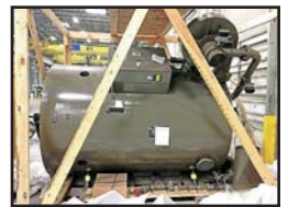
Fulton Mdl. VMP-130LE Boiler