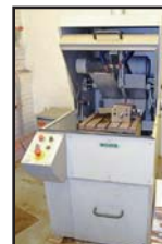
MSX Mdl. 300R Type 300R1 Abrasive Cutoff Saw