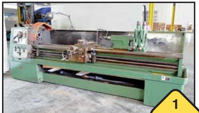
Clausing Mdl. 8056 17" x 110" Geared Head Engine Lathes