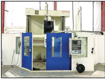
84" Giddings & Lewis CNC Vertical Boring Mill

Houston, Texas – Ft. Worth, Texas – Broussard, Louisiana Erie, Pennsylvania – New Mexico – Richmond, Virginia