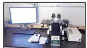
Leica "Metalgraph" Microscope