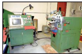
BHS-Torin Mdl. 11 CNC Programmable Spring Coiler