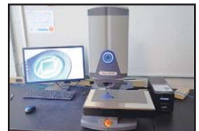
Wilson Mdl. VH3100 Hardness Tester