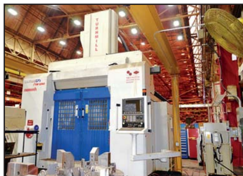
Monarch Mdl. TM1250 TAJMAC/ZPS CNC Turn Mill Vertical Turning Lathe