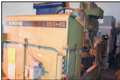
Blanchard Mdl. 220-42 Rotary Surface Grinder