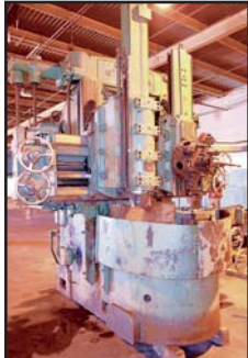
Bullard Cutmaster 42" Vertical Turret Lathe

Bullard Cutmaster 42" Vertical Turret Lathe, with turret head, ram head, side head, pendant controls, 4.1-150 RPM table speeds (no jaws), S/N: 28467 (1953)