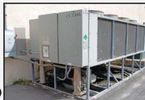
80-Ton Trane Chiller Unit, with Conair Holding Tank and Pumps