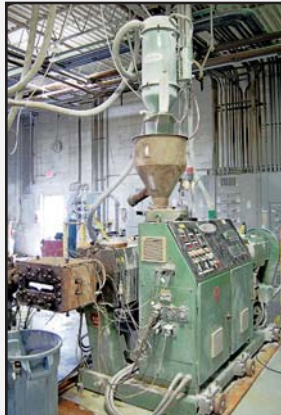
Davis-Standard "Gemini" GC-61 Conical Twin-Screw Extruder