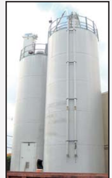
View of 2005 Columbia Tectank Aluminum 2,200 Cu. Ft. Storage Silos

ALSO AVAILABLE: Assorted Molds and Aluminum Sizers