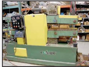
Conair PC8-84 Puller