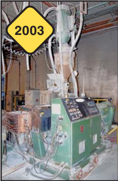
Davis-Standard "Gemini" GC-61 Conical Twin-Feed Extruder

Presorted First Class Mail U.S. Postage PAID Eugene, Oregon Permit No. 17