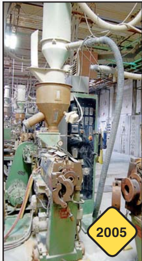
Davis-Standard "Gemini" GC-40 Conical Twin-Screw Extruder