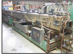
Conair MVS-4-15-8 Vacuum Cooling Tank