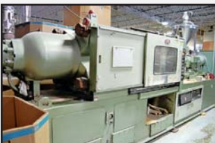
260-Ton Nissei FS260S71ASE Injection Molder

ONE DAY ON-SITE INSPECTION: Wed., Oct. 25th, from 8:00 a.m. to 4:00 p.m.