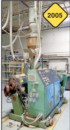
Davis-Standard "Gemini" GC-65 Conical Twin-Screw Extruder