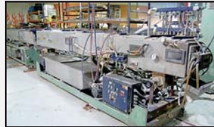
Conair MVS4-15-8 Vacuum Cooling Tank