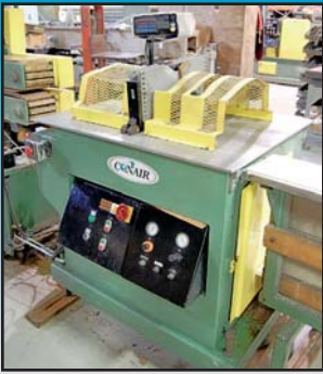
Conair MST-6 Upcut Saw