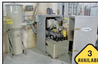
Conair Loader, with 10HP Gardner Denver "Sutorbilt" Pump