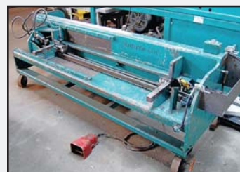
Iowa Precision "Whisper-Loc" FAH456-II