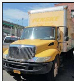
2007 International Mdl. 4300 DT466 24' Box Truck with Power Tailgate