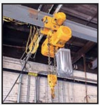
Harrington 5-Ton Electric Hoist