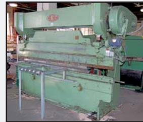
60-Ton x 10' Chicago D&K Press Brake