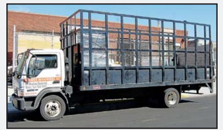
2007 Ford LCF 20' Stake Body with Power Tailgate