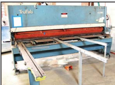
1/4" x 10' Wysong/Chan Mdl. S-1025 Hydraulic Shear