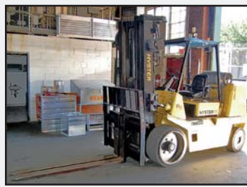
15,000-Lb. Hyster Mdl. S155XL Forklift