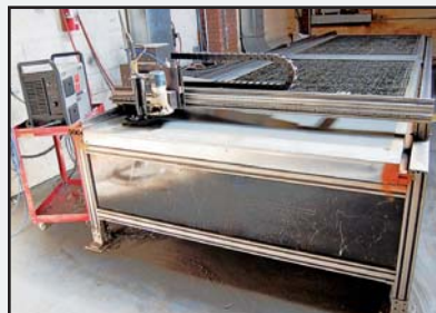
View of Eastcoast Twin 5' x 10' Plasma System