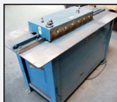
Lockformer 18Ga. Pittsburgh