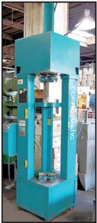
Iowa Precision "Corner-Matic" CM-C-DH Dual Head Corner Machine