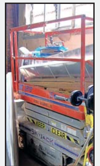
Skyjack SJIII-3219 Motorized Scissor Manlift