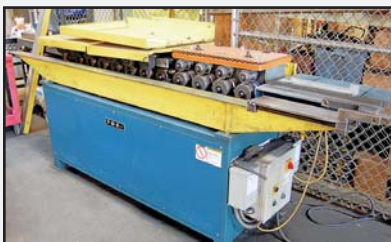
Lockformer TDC Machine