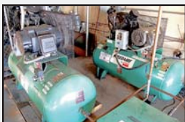
View of 15HP Speedaire Air Compressors