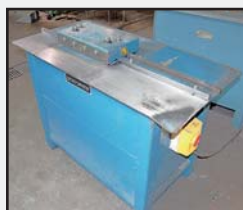
Lockformer 20Ga. Super Speed