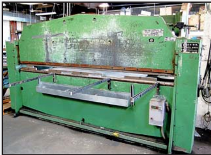
10' Roto-Die Mdl. 15 Bender