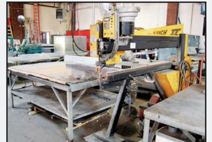
Durodyne RH Mach II Rolling Head Pinspotter