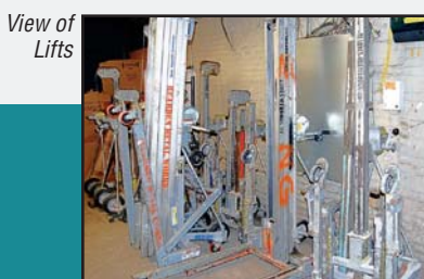
16% BUYER'S PREMIUM WILL APPLY

VISIT OUR WEBSITE FOR PHOTOS, DESCRIPTIONS & TERMS OF SALE