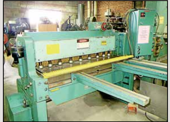
Wysong Mdl. 1052 10Ga. x 52" Power Squaring Shear

20" Delta Rockwell Mdl. 28-350 Vertical Bandsaw , S/N: 1375832