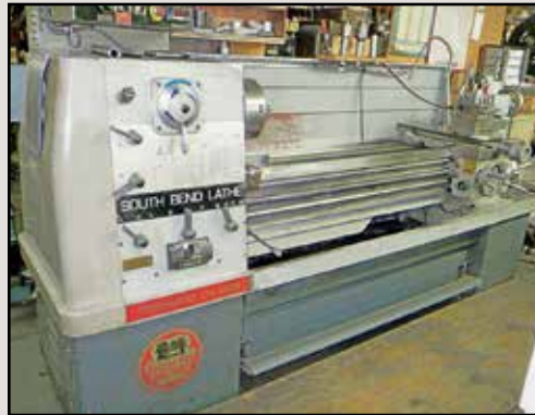
18" x 80" Southbend Turn-Nado EVS Gap Bed Lathe