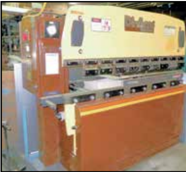
Diacro Promecam Mdl. RG-35-20 Power Press Brake

Presorted First Class Mail U.S. Postage PAID Eugene, Oregon Permit No. 17