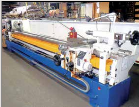
20" x 160" Summit Gap Bed Lathe

AUCTION HIGHLIGHTS: VERTICAL MACHINING CENTERS: 2002 Hurco VMX64/50T and VMX42, Hurco BMC-20 • CNC LATHE: Ikegai TU26 • (10) LATHES: up to 160"cc • (12) MILLING MACHINES: Bridgeport Vari-Speeds and K&Ts • PLANER MILL: 40" x 120" Cincinnati • ROTARY GRINDER: 36" Blanchard 20-36 • PRESS BRAKE: DiAcro/Promecam RG-35-20 • SHEAR: 10Ga. x 52" Wysong • DRILLS: 4' Radial Drill and Burgmasters; (11) SAWS – Incl. DoAlls, Kalamazoo, Wilton • FORKLIFTS: 2010 8,000-Lb. & 6,000-Lb. Toyotas • AIR COMPRESSORS – Plus Much More!