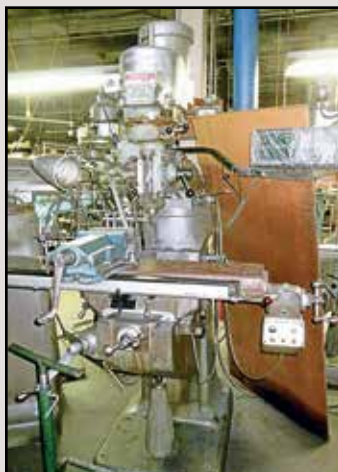
Bridgeport Series I 2HP Vertical Milling Machine

Milwaukee Mdl. 1H-18 Horizontal Milling Machine , S/N: 24-2954