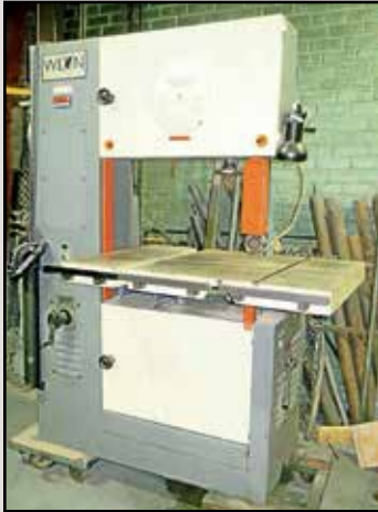
Wilton Mdl. 8127 28" Vertical Bandsaw