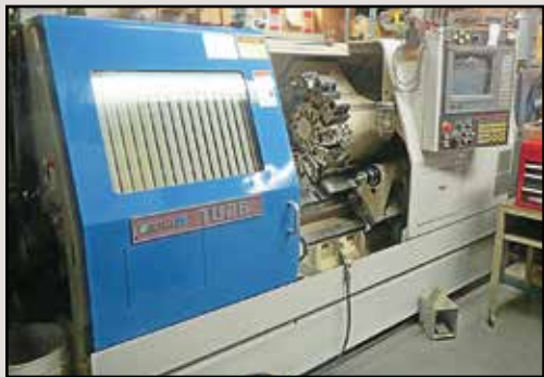
Ikegai Mdl. TU26 CNC Turning Center