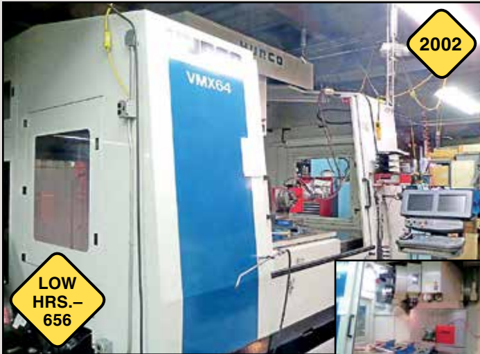
Hurco Mdl. VMX64/50T CNC Vertical Machining Center

AUCTION HIGHLIGHTS: VERTICAL MACHINING CENTERS: 2002 Hurco VMX64/50T and VMX42, Hurco BMC-20 • CNC LATHE: Ikegai TU26 • (10) LATHES: up to 160"cc • (12) MILLING MACHINES: Bridgeport Vari-Speeds and K&Ts • PLANER MILL: 40" x 120" Cincinnati • ROTARY GRINDER: 36" Blanchard 20-36 • PRESS BRAKE: DiAcro/Promecam RG-35-20 • SHEAR: 10Ga. x 52" Wysong • DRILLS: 4' Radial Drill and Burgmasters; (11) SAWS – Incl. DoAlls, Kalamazoo, Wilton • FORKLIFTS: 2010 8,000-Lb. & 6,000-Lb. Toyotas • AIR COMPRESSORS – Plus Much More!