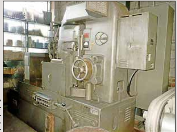
Blanchard No. 20-36 36" Rotary Surface Grinder

To Register For This Auction & Terms of Sale, Please Visit www.kosterindustries.com