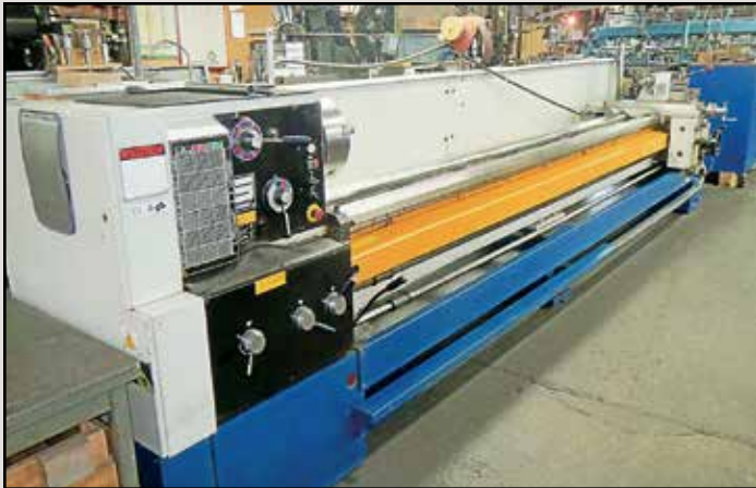
20" x 160" Summit Gap Bed Lathe