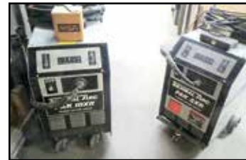
Thermal Arc Plasma Cutting Systems

Thermal Arc Mdl. PAK10-XR Plasma Cutting System