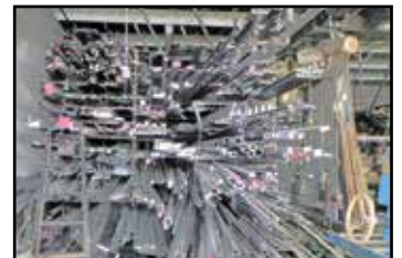
Partial View of Raw Material

MISCELLANEOUS SHOP & CRIB, INCL.: Miscellaneous Drills, Taps, Reamers, CNC Tool Holders, Hydraulic Pallet Jacks, Scales, Shelving, Racking, Electric Chain Hoists, 2-Wheel Hand Trucks, Hose, Brake Dies, Jig Rig Forklift Attachment, Dollies, Long and Short Clamps, Electric and Pneumatic Hand Tools, Ladders, Saw Blades, Pneumatic Nail Guns, Tool Chests, Steel Layout Tables, Drill Chucks, Kurt Milling Vises, Work Benches and Vises, Shop Vacs, Shop Fans, Assorted Hardware, Extension Cords, V-Belts, Jacks, Heaters, Burning Gage and Torch Sets, Ridgid 400 Pipe Threading, Portable Enerpac Units, Shop Stools, Electrical Supplies, Wire, Chains, Lifting Straps, Hand Pipe Benders, Plate Clamps, 2-Door Steel Storage Cabinets, Hand Tools, PCs, Fax Machine, Desks, Chairs, File Cabinets, Shelving, Much, Much More.