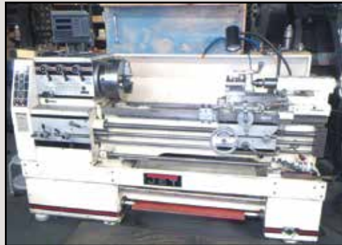
14" x 40" Jet Mdl. 1440-3PGH Gap Bed Lathe