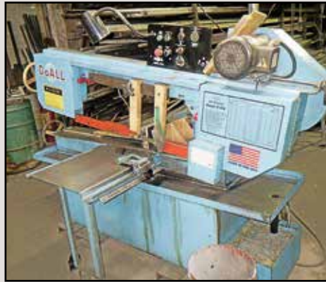
DoAll Mdl. C-916 Horizontal Bandsaw

12-Ton x 48" Bantam Mdl. B412 Press Brake , S/N: A8424