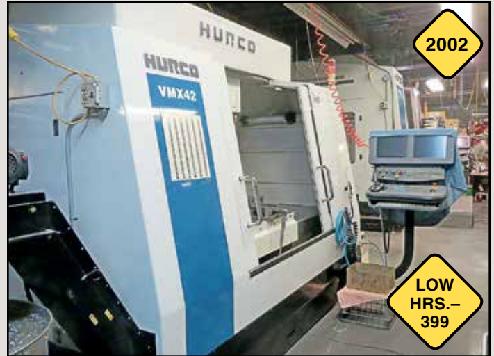
Hurco Mdl. VMX42 CNC Vertical Machining Center