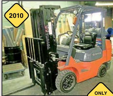
6,000-Lb. Toyota Mdl. 7FGCU32 Propane Forklift Truck