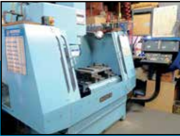
Hurco Mdl. BMC-20 CNC Vertical Machining Center