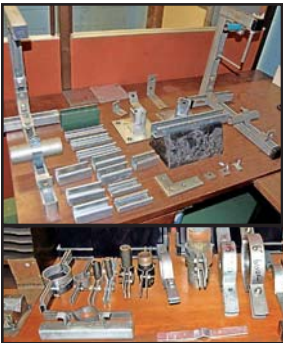
Partial View of Rollformed Product and Stamped Accessories

Presorted First Class Mail U.S. Postage PAID Eugene, Oregon Permit No. 17