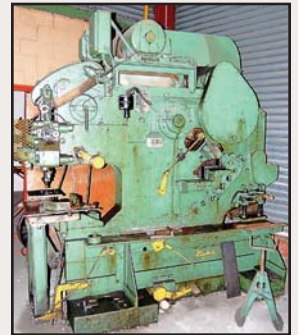
111-Ton Buffalo #2-1/2 Ironworker