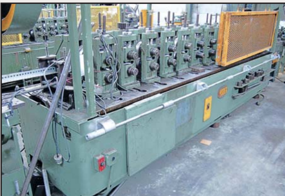
Partial View of 12-Stand Yoder M1.5 Roll Forming Line