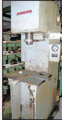
16-Ton Hannifin Mdl. 16TONF-160-AO.G C-Frame Press