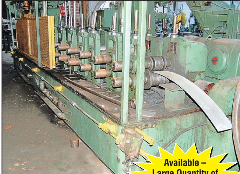
Partial View of 12-Stand Yoder M2.5 Strut Channel Roll Former