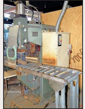
100-KVA Standard Mdl. PP1-12-100 Press-Type Spot Welder, with solid state controls

5" x 10" Sanford Hand Feed Surface Grinder , Walker permanent magnetic chuck