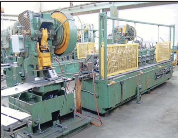
Partial View of 12-Stand Yoder M1.5 Roll Forming Line