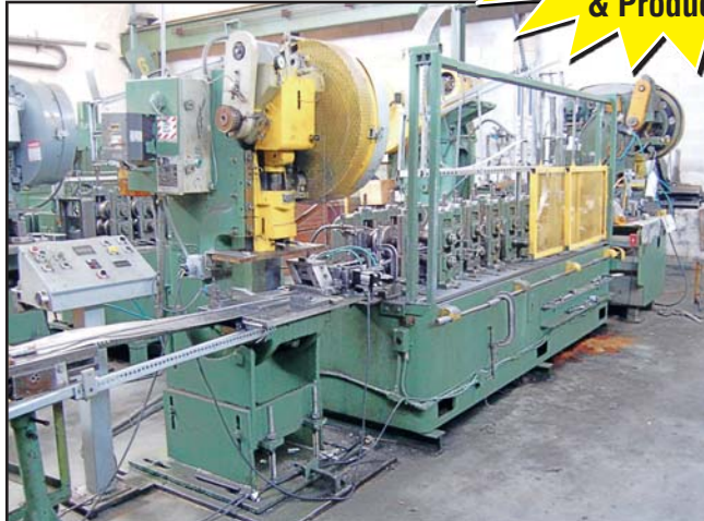
Partial View of 7-Stand Yoder M1.5 Roll Forming Line

Available – Large Quantity of Finished Goods & Products