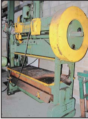
60-Ton Rousselle Mdl. 6SS72 Single-Crank Straight-Side Press