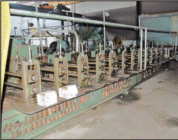
Partial View of 12-Stand Yoder 48" Panel Forming Line

5-Stand Cantilever-Type Roll Former , 1.5" Arbors, approximately 2" vertical adjustment, 6" long arbors