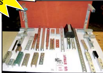
Partial View of Sample Struts

Can't attend this auction? Bid online at