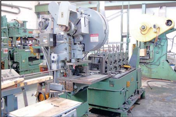
View of 5-Stand Yoder M1.5 Channel Roll Former